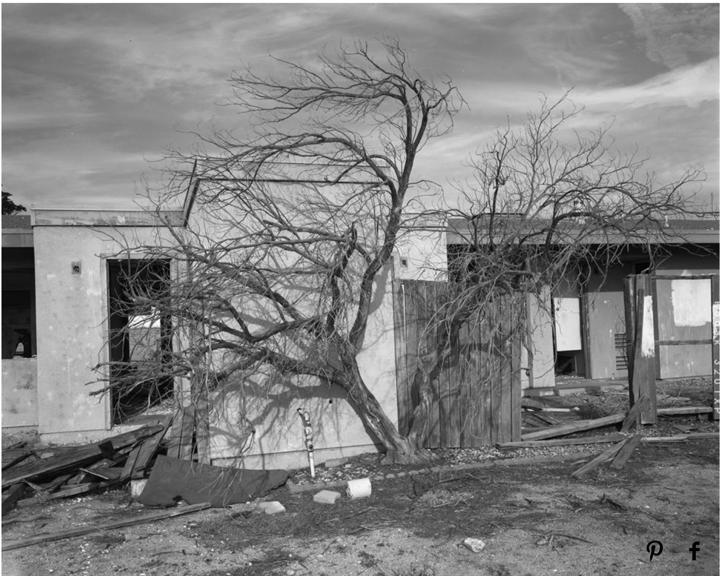
Work in Progress George Air Base, Untitled, 2015