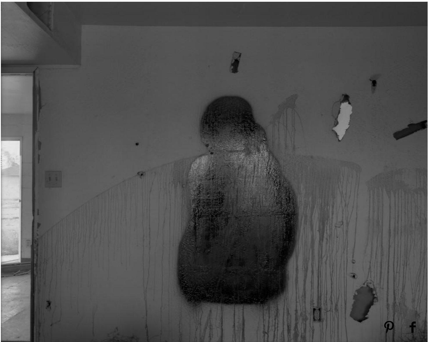
Work in Progress George Air Base, Untitled, 2016