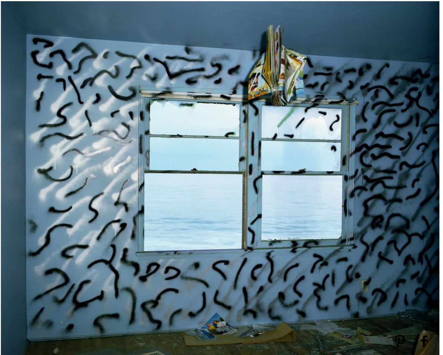
From Zuma Series, Zuma #68, 1977