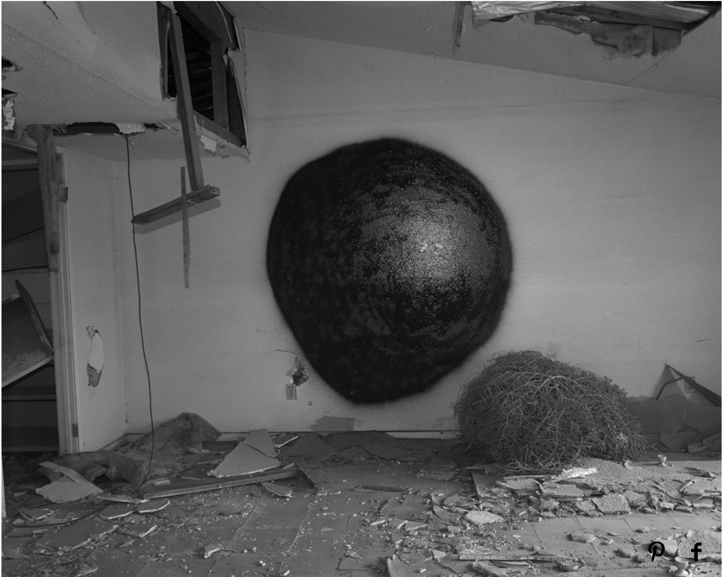
Work in Progress George Air Base, Untitled, 2015

As Far As I Could Get (10 seconds), R02F06, 1996/97