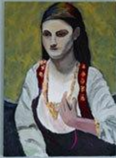
Abandoned Painting A, 2007