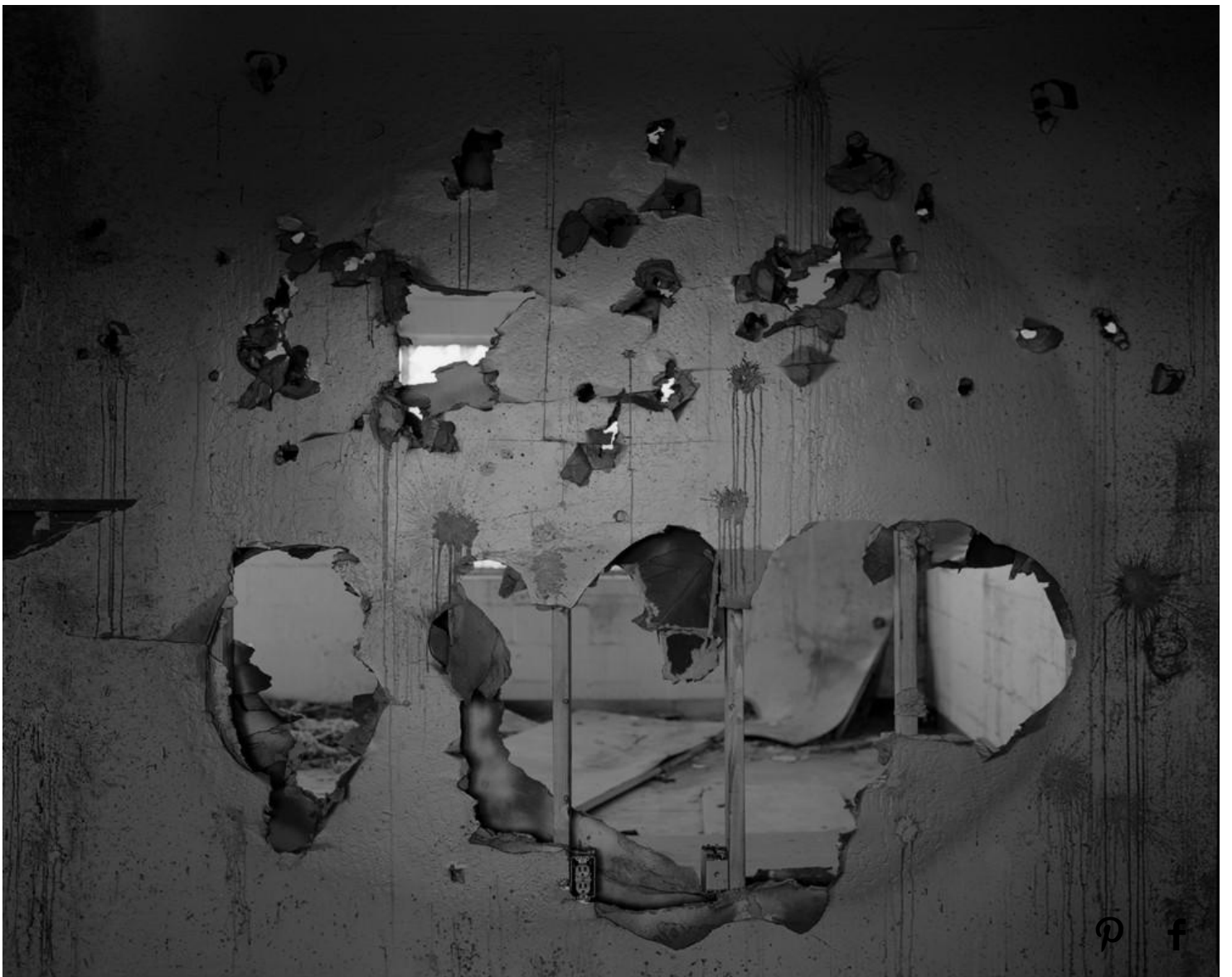
Work in Progress George Air Base, Untitled, 2016