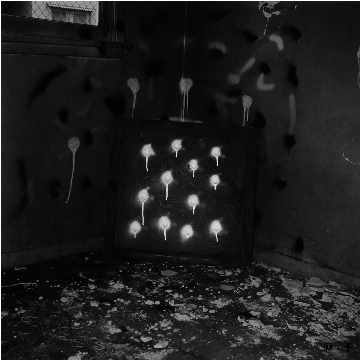
Form Vandalism Series, 74V34, 1974