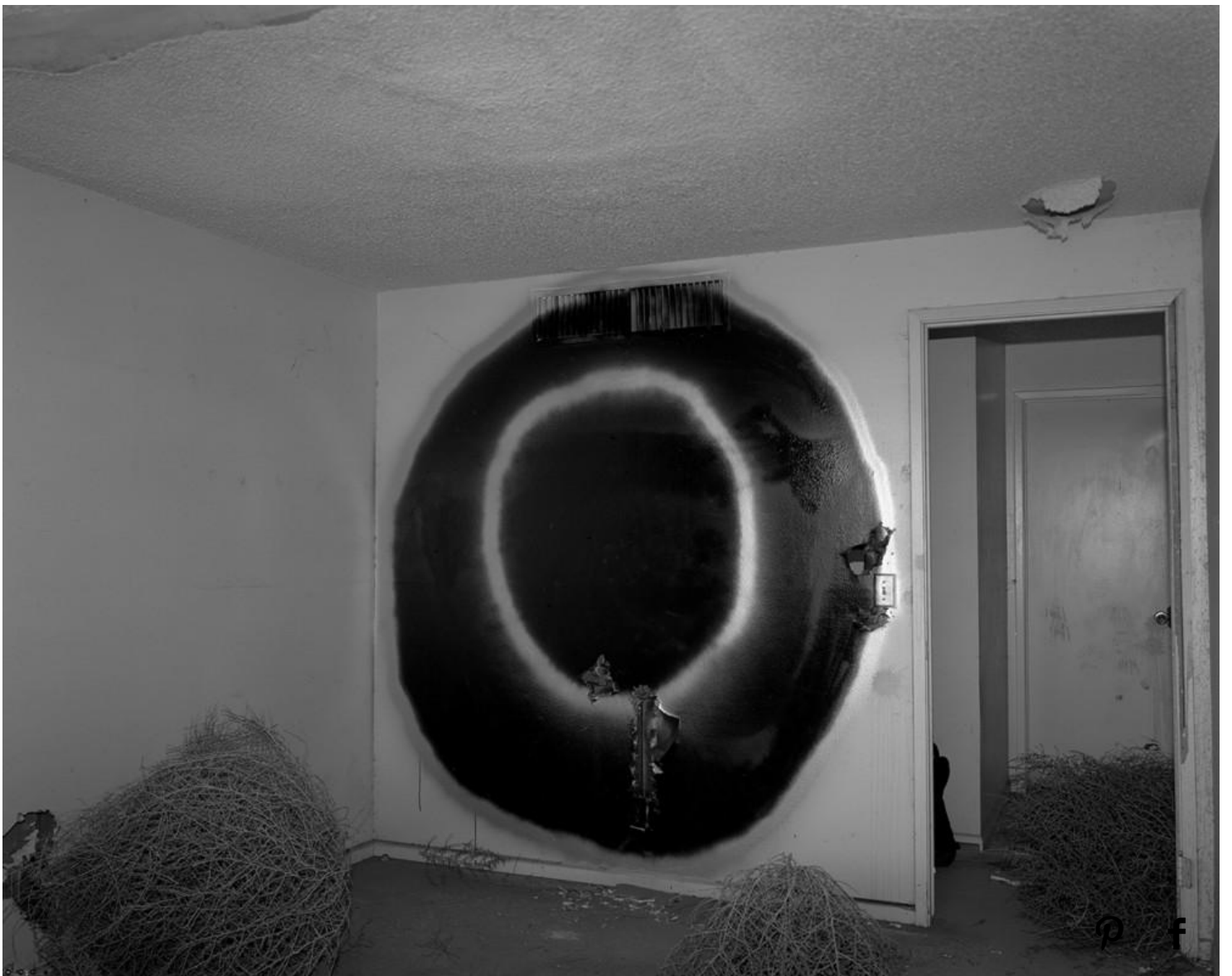
Work in Progress George Air Base, Untitled, 2015