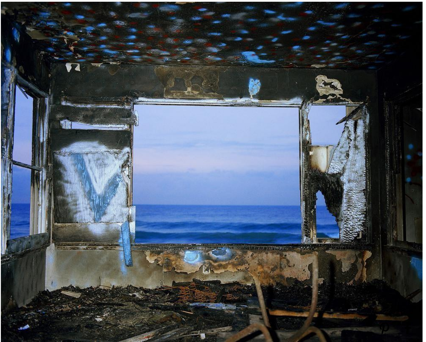
From Zuma Series, Zuma #25, 1978