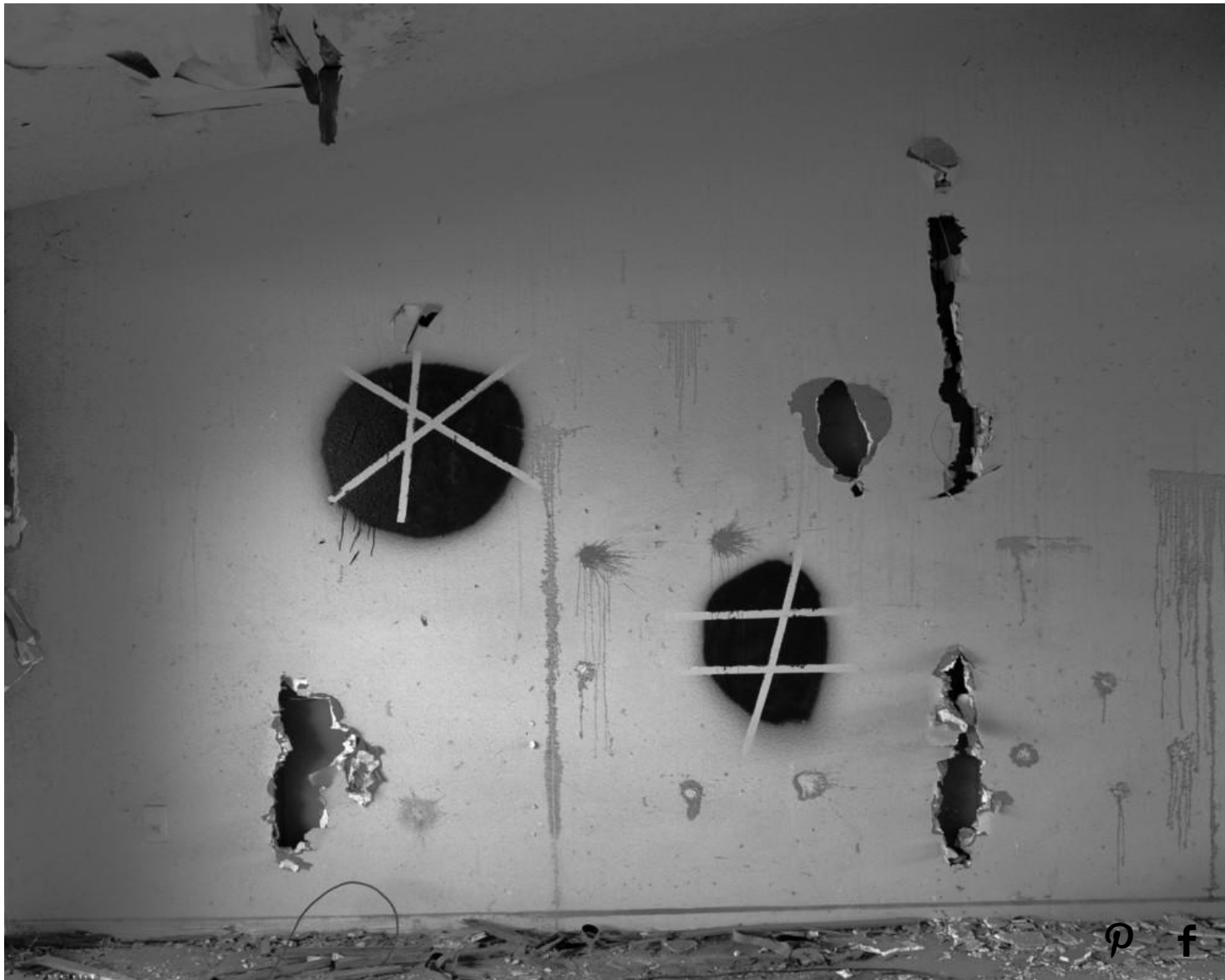
Work in Progress George Air Base, Untitled, 2015

As Far As I Could Get (10 seconds), R02F09, 1996/97