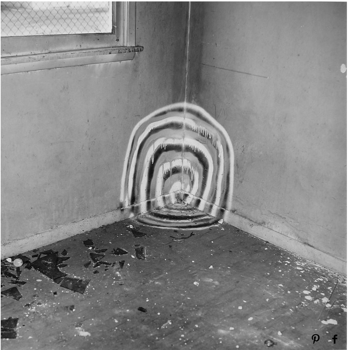
From Vandalism, 74V17, 1974

The black-and-white photographs in his Vandalism series, which he made in those abandoned homes, still feel transgressive today; they also work as pure imagery. Circles emanate out concentrically, dots resolve into patterns, or pyramids. Some of the pictures almost seem to vibrate, like optical illusions. They speak to the history of painting, to street art, to photography. But despite the title of the series, looking back Divola doesn't see a link between what he did and traditional graffiti.