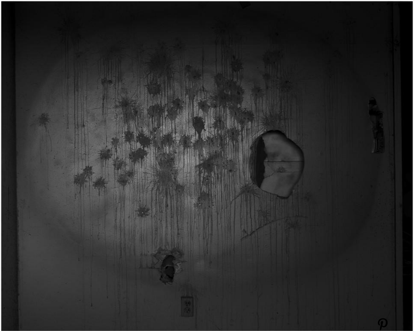
Work in Progress George Air Base, Untitled, 2016