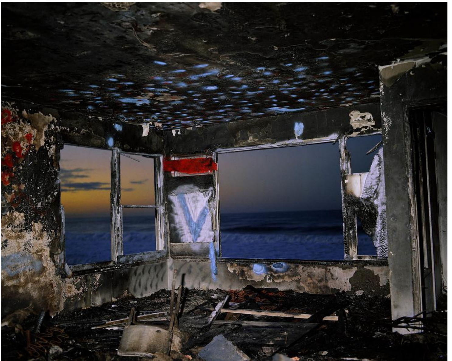
From Zuma Series, Zuma #04, 1978