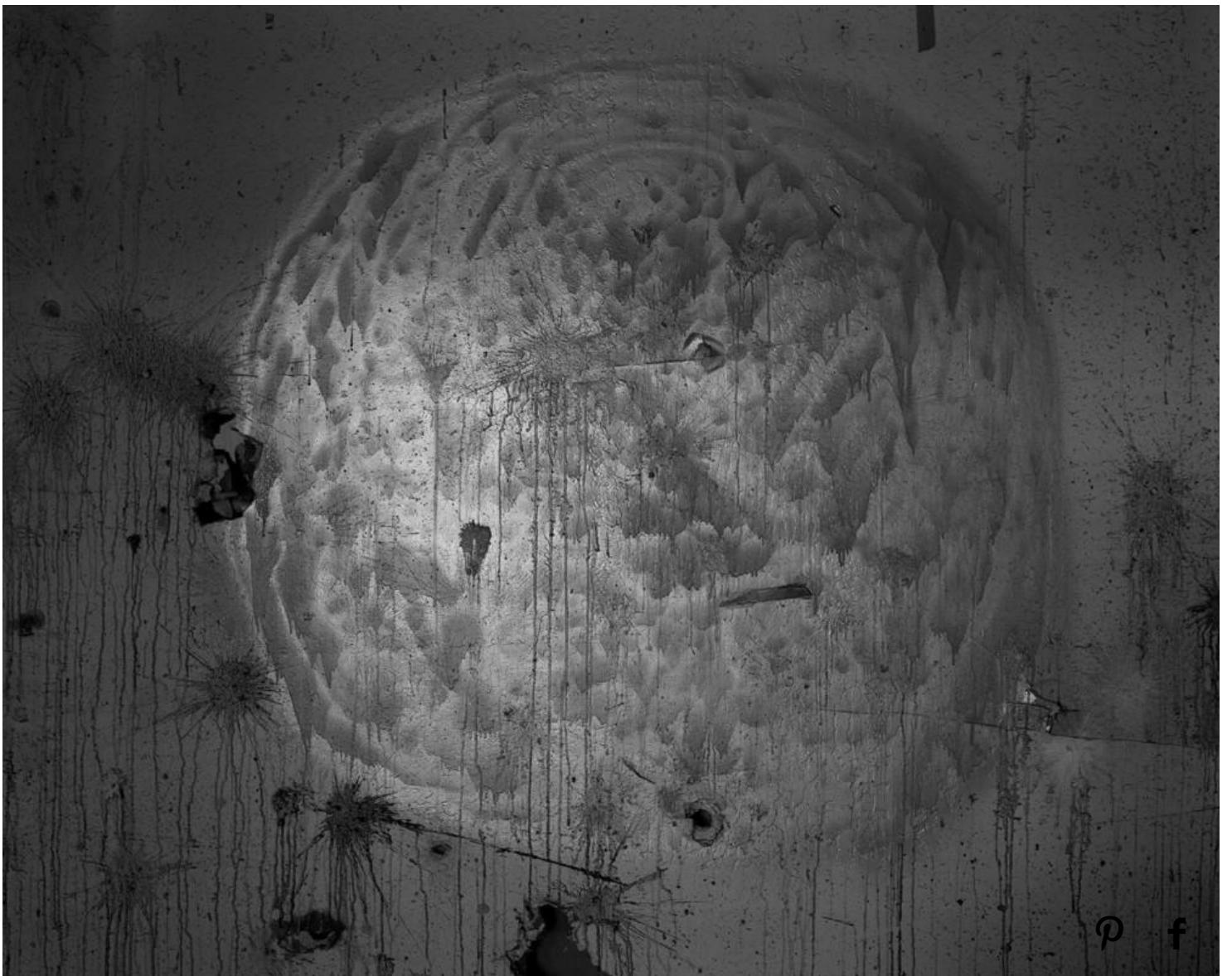
Work in Progress George Air Base, Untitled, 2016