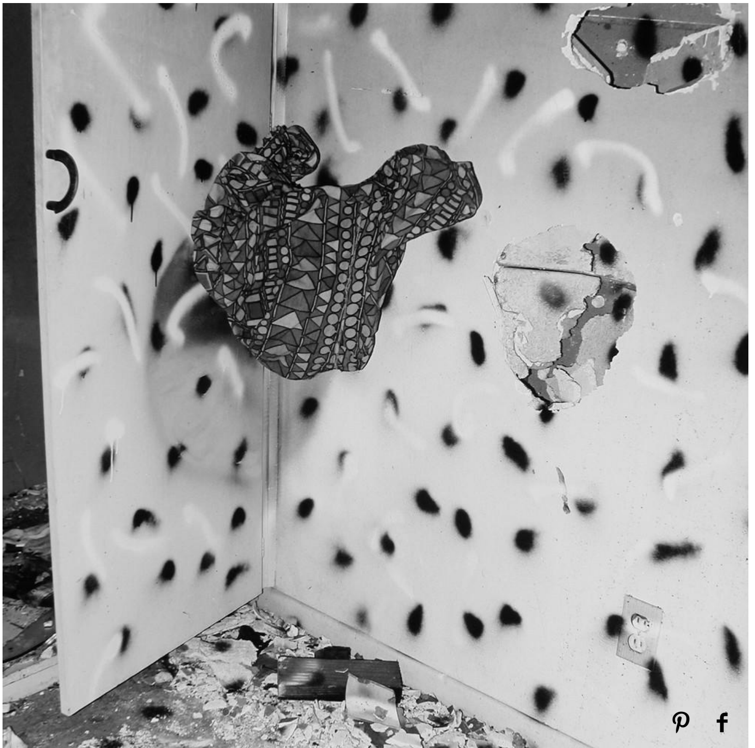
Form Vandalism Series, 74V02, 1974